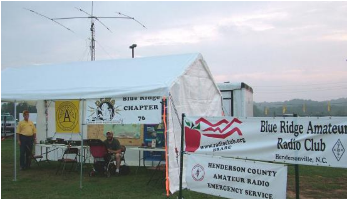
Amateur Radio at the Western NC Mountain State Fair