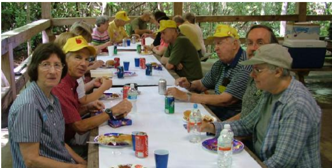
BRARC Chows Down

Picnic Was Great — The weather was great, the food was great, the company was great. What more could one ask for? Twenty-one members and guests enjoyed our annual picnic. Especially notable were the hot dogs. Some of us were heard to remark they were so good, no mustard was needed.