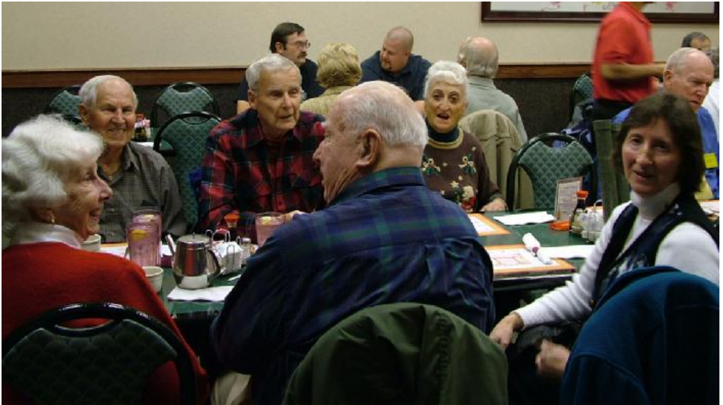
Enjoying the BRARC Dinner at Twin Dragons